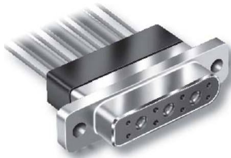
GMPMT-D113P with (6) #24 pins and (3) 2mm. sockets

13 Amp Current Rating —Combo Micro-D's combine the size and weight advantages of a Micro -D connector with the added ability to handle higher power needs.